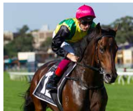
The Chosen One

The Chosen One's victory in the Frank Packer Plate also compared favourably to the winners' 111 average rating for the past five years, his 112+ figure being one pound superior.