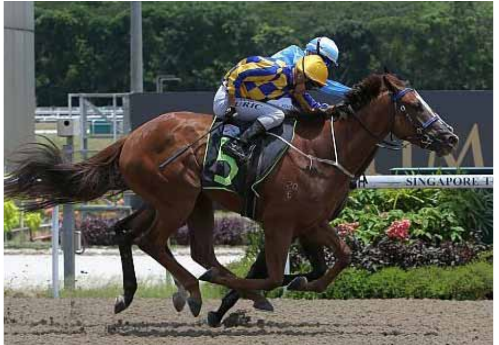
Heavenly Dancer (nearside)