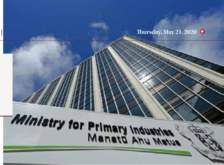
Ministry for Primary Industries

While the disease cannot be passed from horse to horse without the ticks known to transmit the parasite - with those tick species not found in New Zealand - most veterinary agreements with other countries require that equine