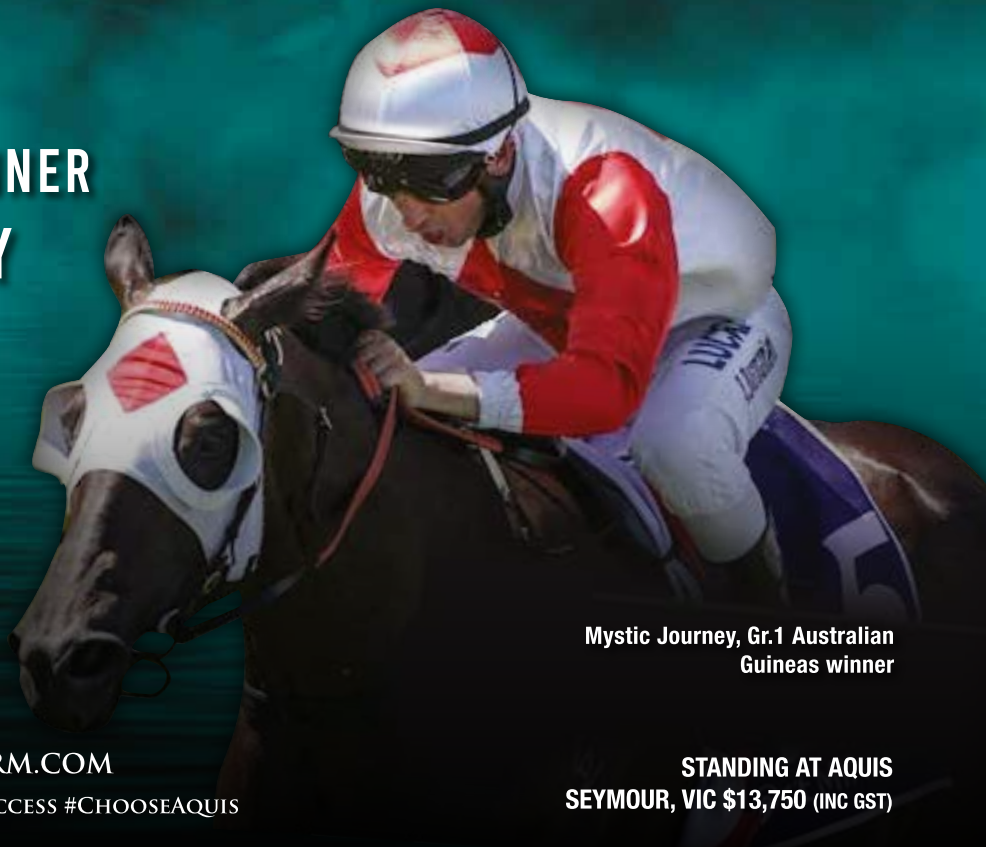
Mystic Journey, Gr.1 Australian Guineas winner