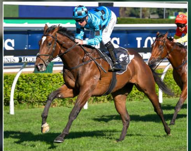
Equation - 1 st ATC 2yo Hcp 1100m 3 June 2020

"I have a pretty big opinion of this colt. I think in time you're going to see a really nice, progressive young horse. The best is yet to come." - winning jockey Tommy Berry