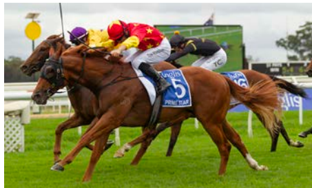
Prime Star winning this year

Inglis yesterday announced that its $2 million juvenile feature, which has only been run for two years, would be run at Randwick in 2021