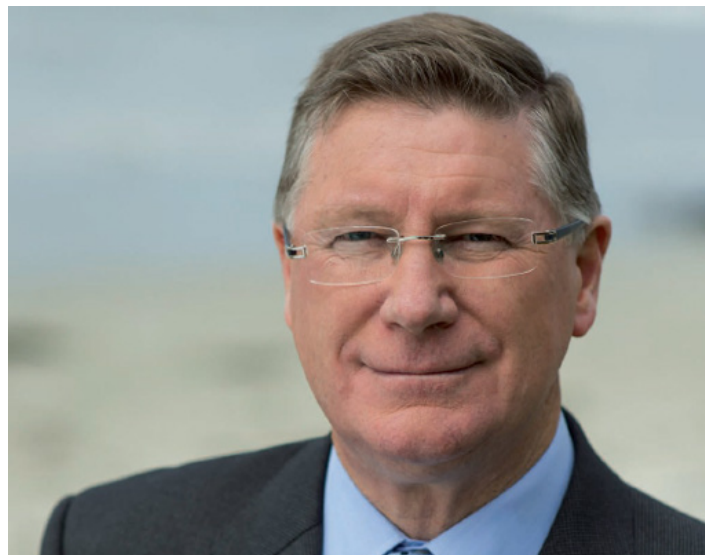
Dr Denis Napthine

Once submissions close in July, the panel will put together a report with their recommendations. Their findings are expected at some point during the spring.