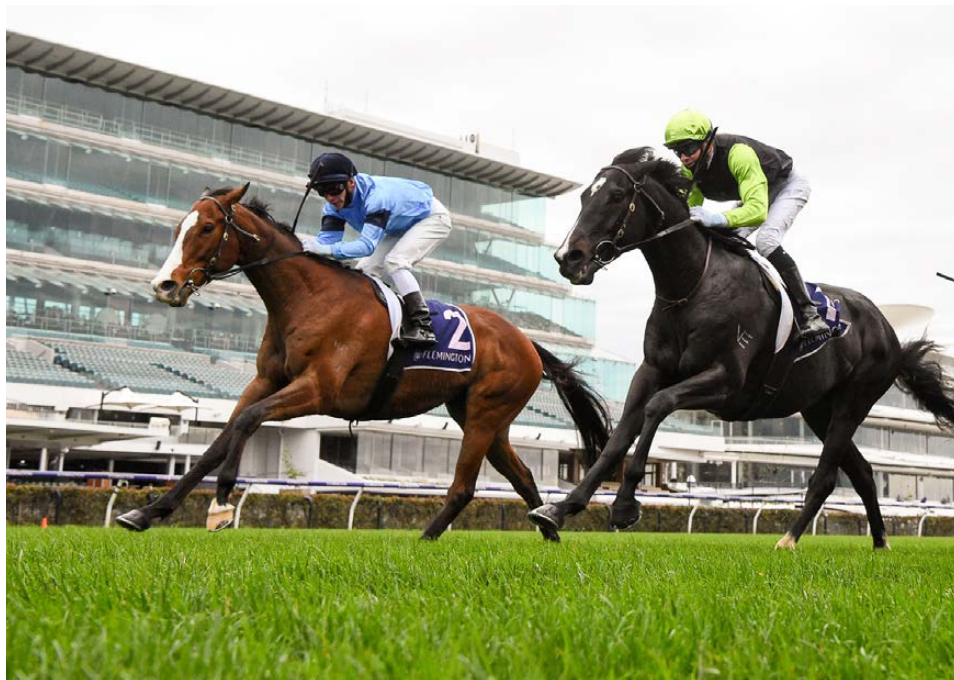
Lord Belvedere (left)