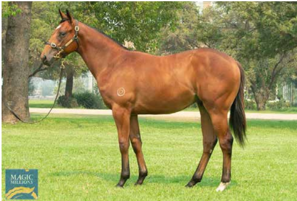
Astrologer - pictured as a yearling

G1G Racing and Breeding share in ownership of ten juveniles stepping out in Sydney heats