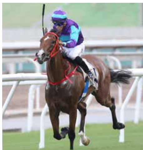
Winning Dreamer remains unbeaten