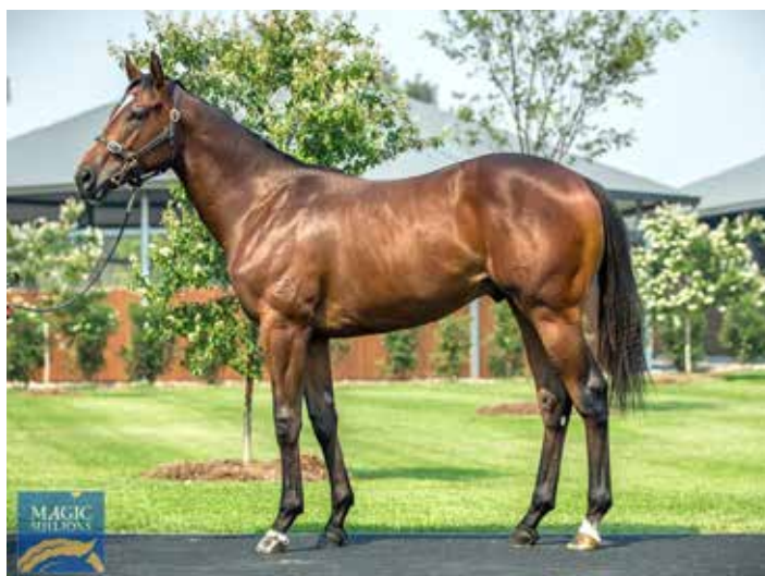
Revivalist - pictured as a yearling

As for expectations today, Diamond is not getting ahead of himself.