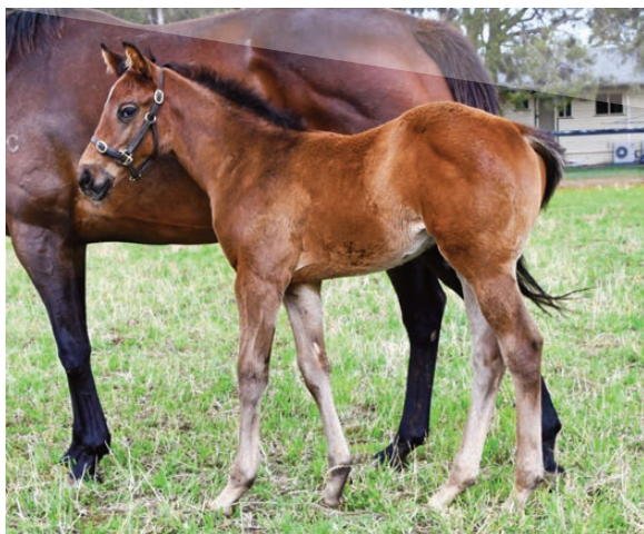
Colt ex. Mongolian Beauty (winning full-sister to G2W Mongolian Falcon by Fastnet Rock)