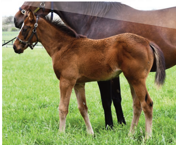
Filly ex. I'll Have a Bit (first foal for the G2-winning and G1 placed sprinter)