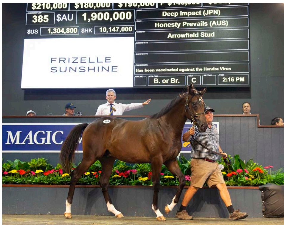
Magic Millions sales ring

Afternoon session to open January auction to cater for bigger yearling catalogue in 2021