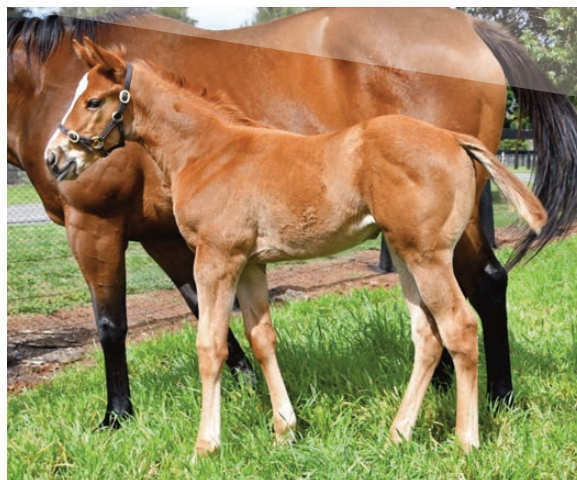
Filly ex. Pickin' Time (Stakes-placed Fastnet Rock mare from the family of triple G1W Special Harmony)