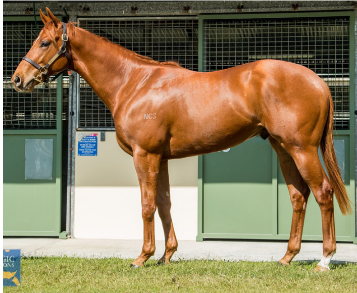
Lot 45 Territories - Rosalita colt

Consigned by Symphony Lodge as Lot 45 , the colt was the fastest of 57 two-year-olds to breeze at the final session before the auction after hit-