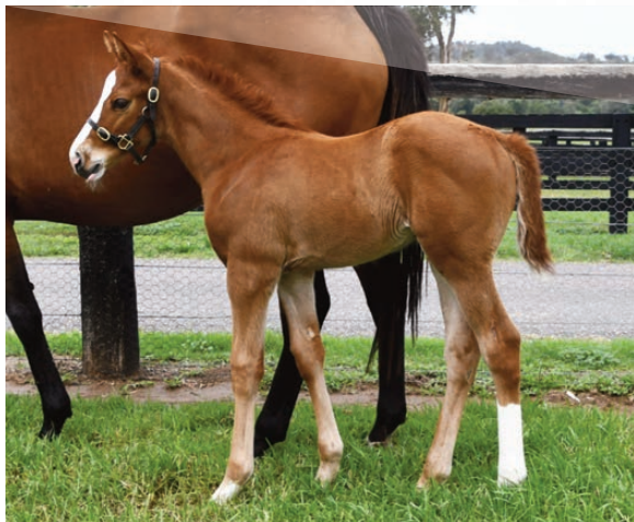
Filly ex. Fair Isle (winning Fastnet Rock daughter of SW and G1 Oaks placed Miss Scarlatti)